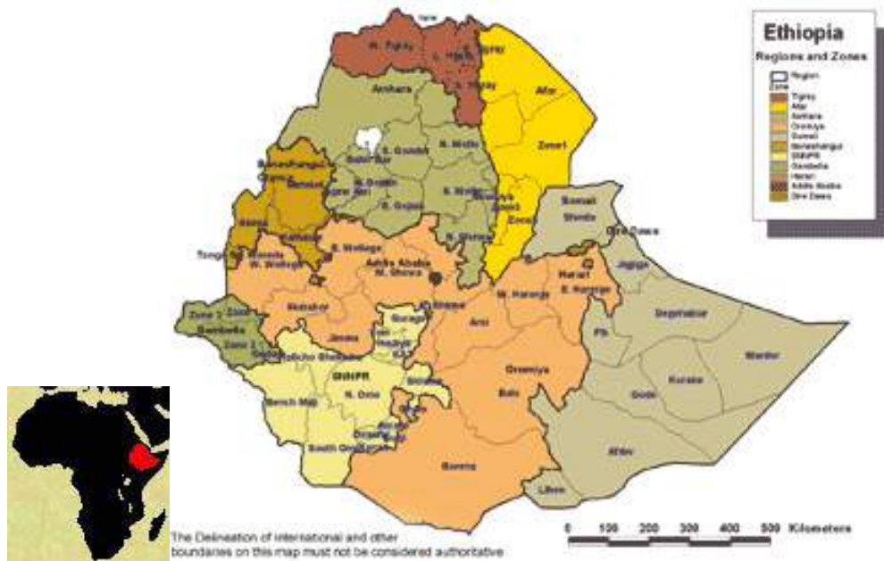
Figure 1: Location map of Ethiopia.

Geographically Ethiopia belongs to the tropics but its climatic conditions are influenced not only by latitude but also by altitude (elevation) and the seasonal migration of the Inter Tropical Convergence Zone (ITCZ) following the position of the sun relative to the earth and the associated atmospheric circulation. As the result the country comprise diversified climate that combines tropical, sub-tropical and temperate types. Typical tropical climate is encountered in the low-lying areas, especially in the west and southwest. Temperature decreases towards the interior of the country where much of the area is mountainous. Maximum and minimum temperatures in the country range from over 40°C in the lowlands to less than 10°C in the highlands. The rain fall distribution is seasonal and is mainly governed by the ITCZ that passes over Ethiopia twice a year. The ITCZ movement causes variation in the wind flow patterns and the onset and withdrawal of winds from north and south. The mean annual rainfall ranges from 100 mm to 2800 mm depending on the site. The South-western region receives the highest annual rainfall which goes up to 2800 mm. The central and northern regions receive moderate rainfall that gradually declines towards the low-lying Arid and Semiarid Lands (ASALs) that receive an annual rainfall ranging between 100 - 700 mm. The Danakil Depression, the lower Awash River Basin and Eastern Ogaden are the driest areas of Ethiopia.